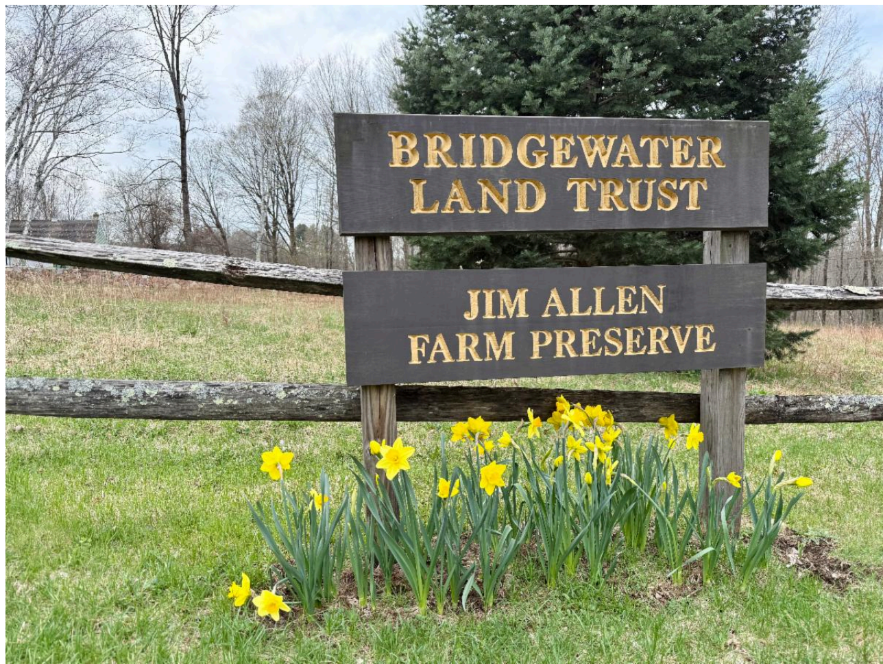
The roadside view of the Jim Allen Farm Preserve on Hut Hill Road where the vegetable garden and the bluebird boxes will be located