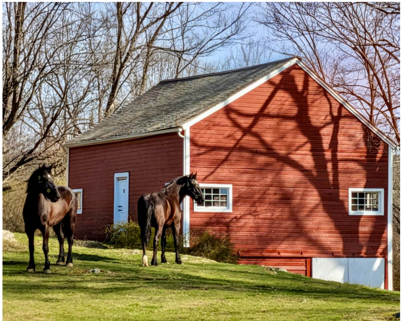
The historic barn at the Peardon Preserve will get a new roof thanks to community support and the Ellen Knowles Harcourt Foundation