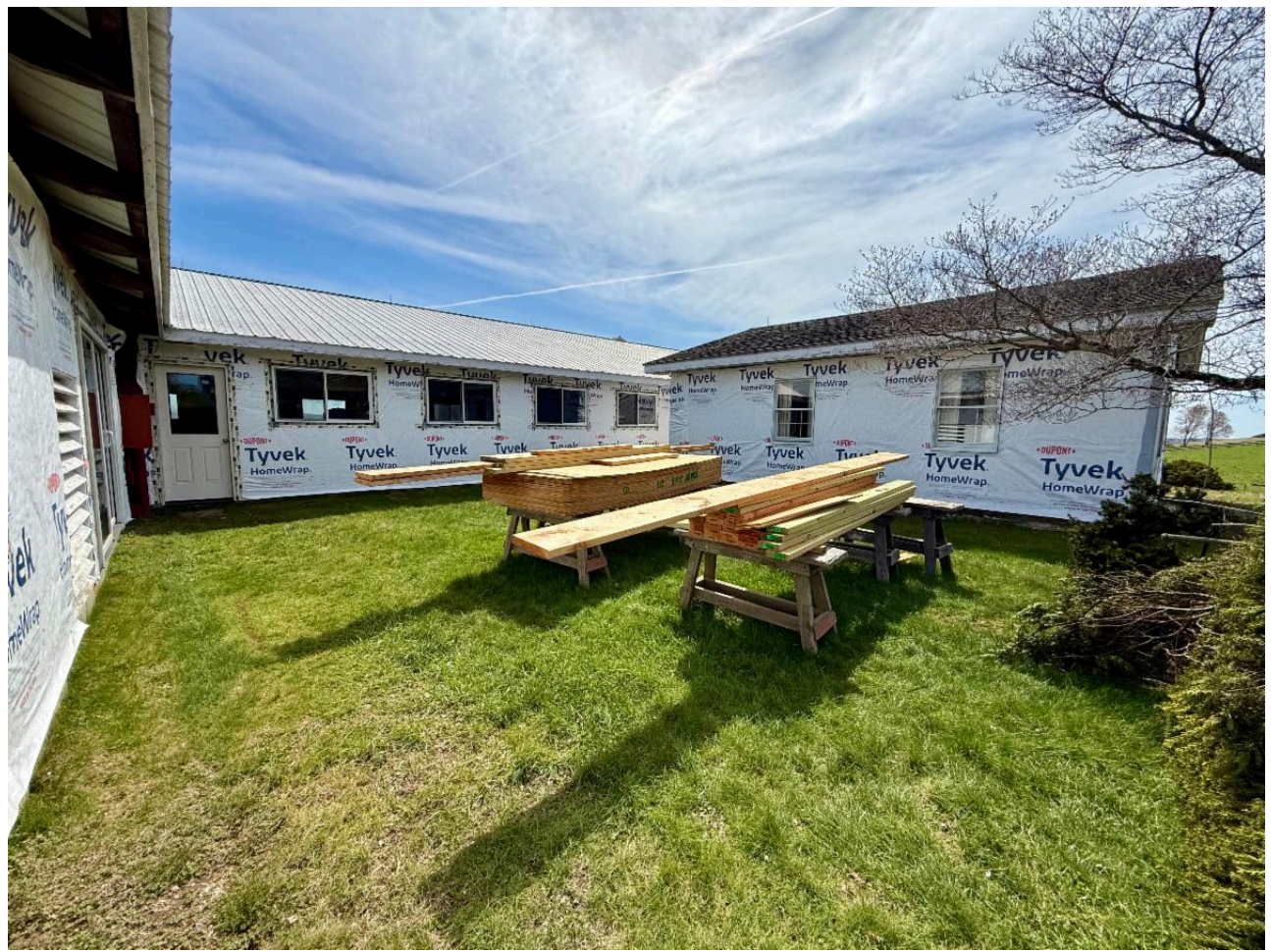
Progress at the Town Line Farm Preserve dairy barn