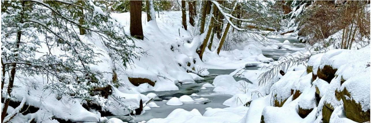
Clapboard Oak Brook, Bridgewater