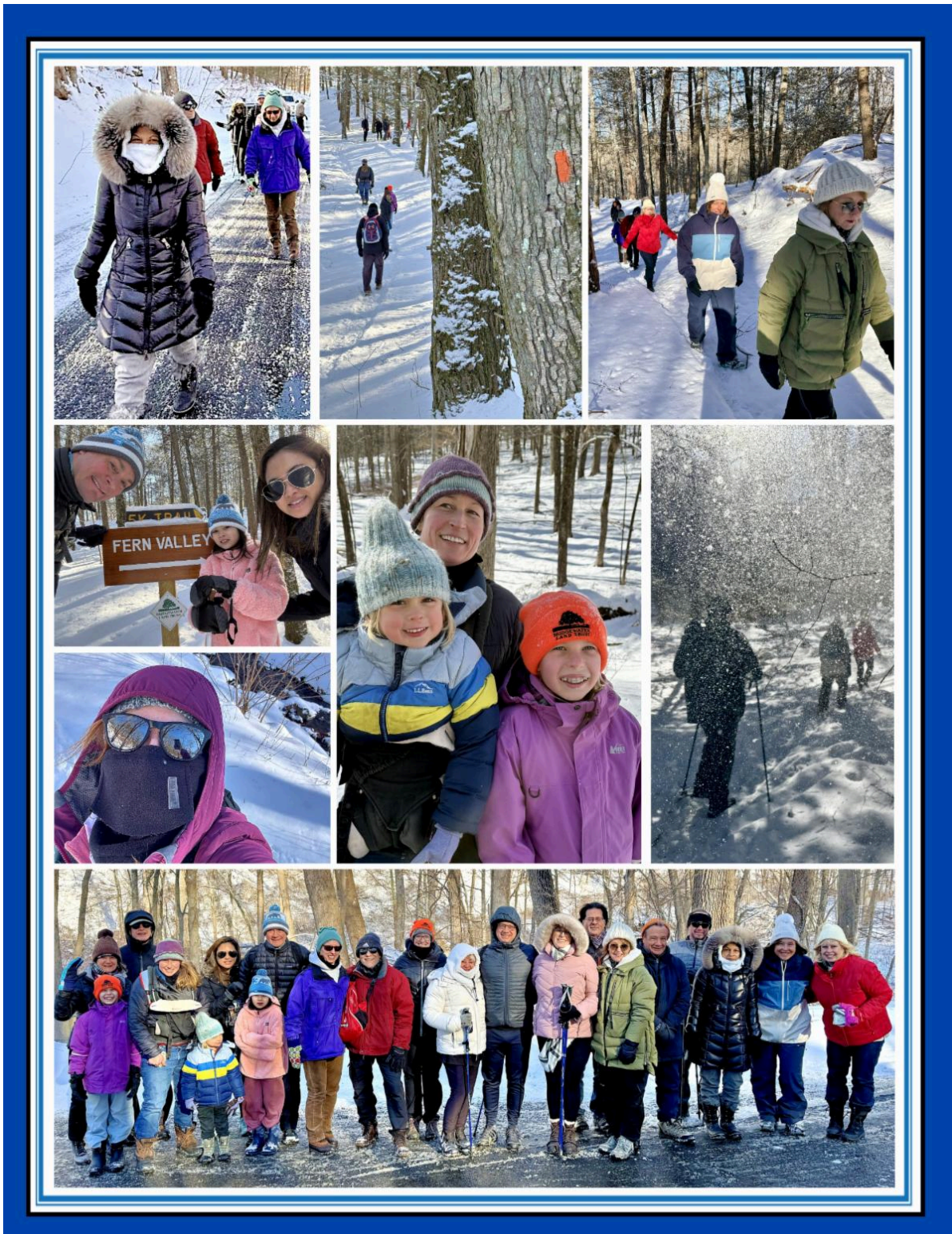
Bridgewater hikers on New Year's Day

On January 1st, we hosted a group of 25 "First Day" hikers who went tromping through the snow to start the New Year on the right foot, a perfect example of the spirit of this challenge.