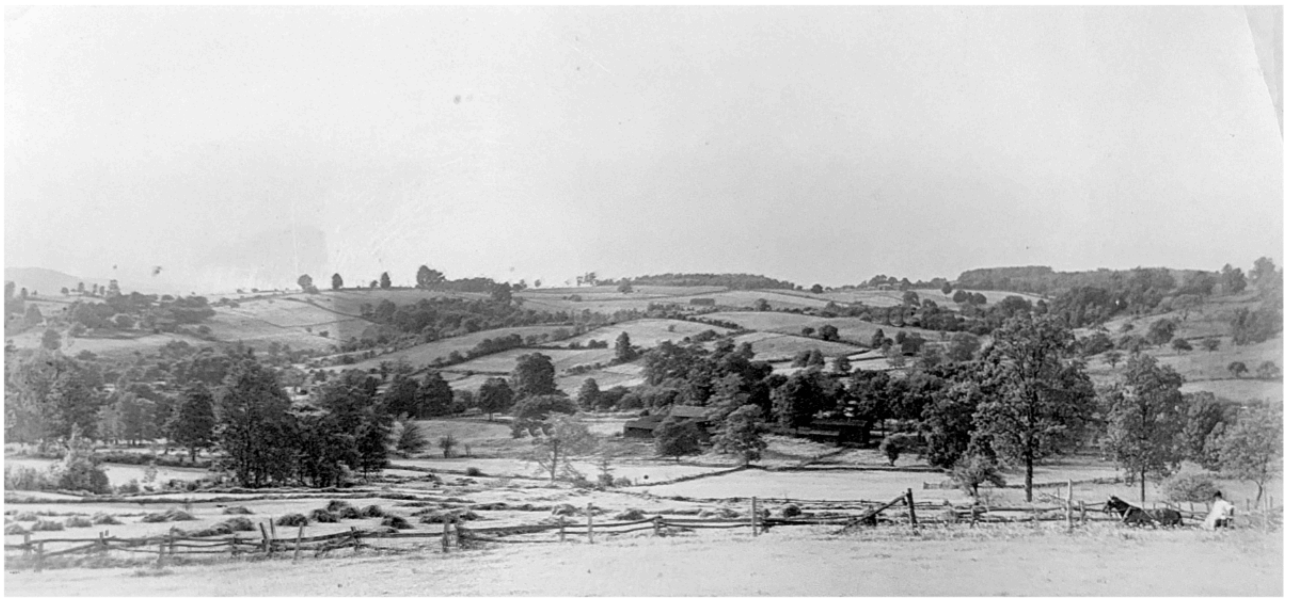
1924 - The horse and buggy in the bottom right of the photo is heading along Warner Road towards Christian Street. Hay fields are in the foreground with Hat Shop Hill and Second Hill visible in the distance.