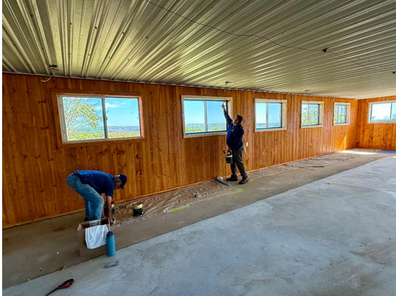
Taurus Painting Services adding the final touches to the inside paneling.