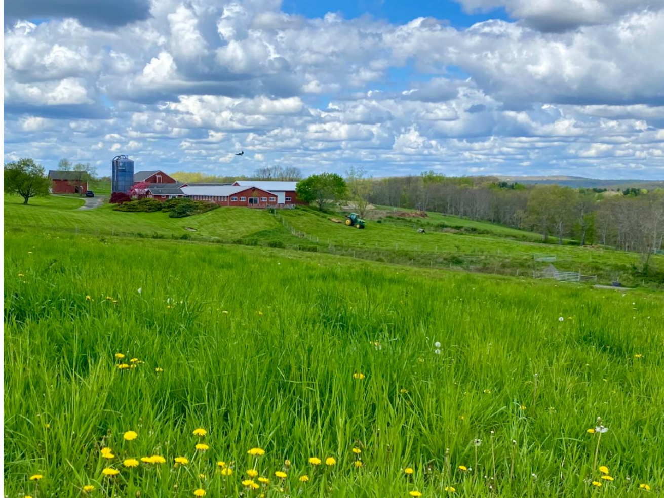
The Town Line Farm Preserve