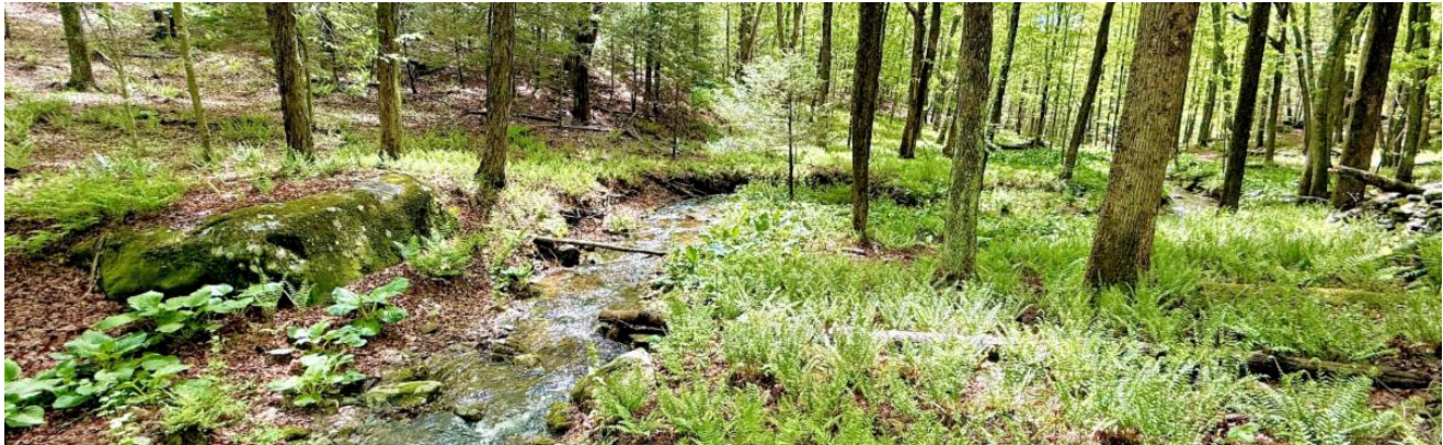
Tappen Brook Preserve