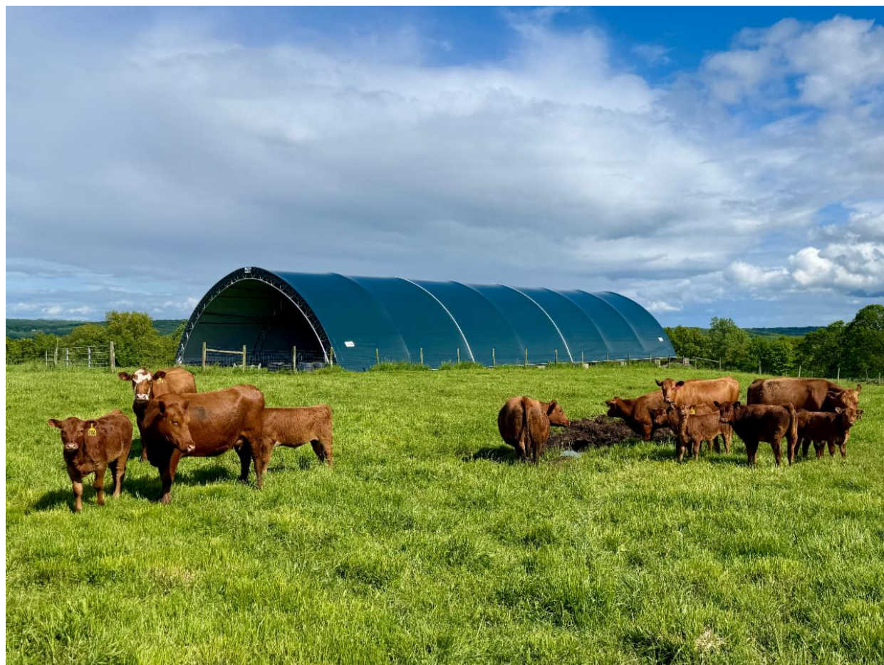
The hay storage dome at the Town Line Farm Preserve

You can purchase tickets now for our annual benefit Under The Dome at the Town Line Farm Preserve. A unique transformation will take place in order to turn a hay storage dome into a temporary party barn. You won't want to miss it! Proceeds from this benefit will support the dairy barn renovation. See details below.