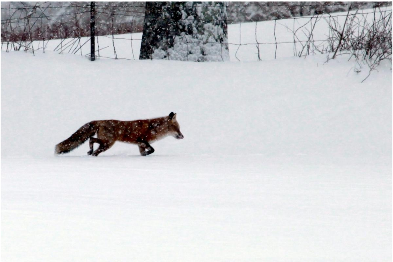
A red fox heading from Warner Road towards Sarah Sanford Road East.