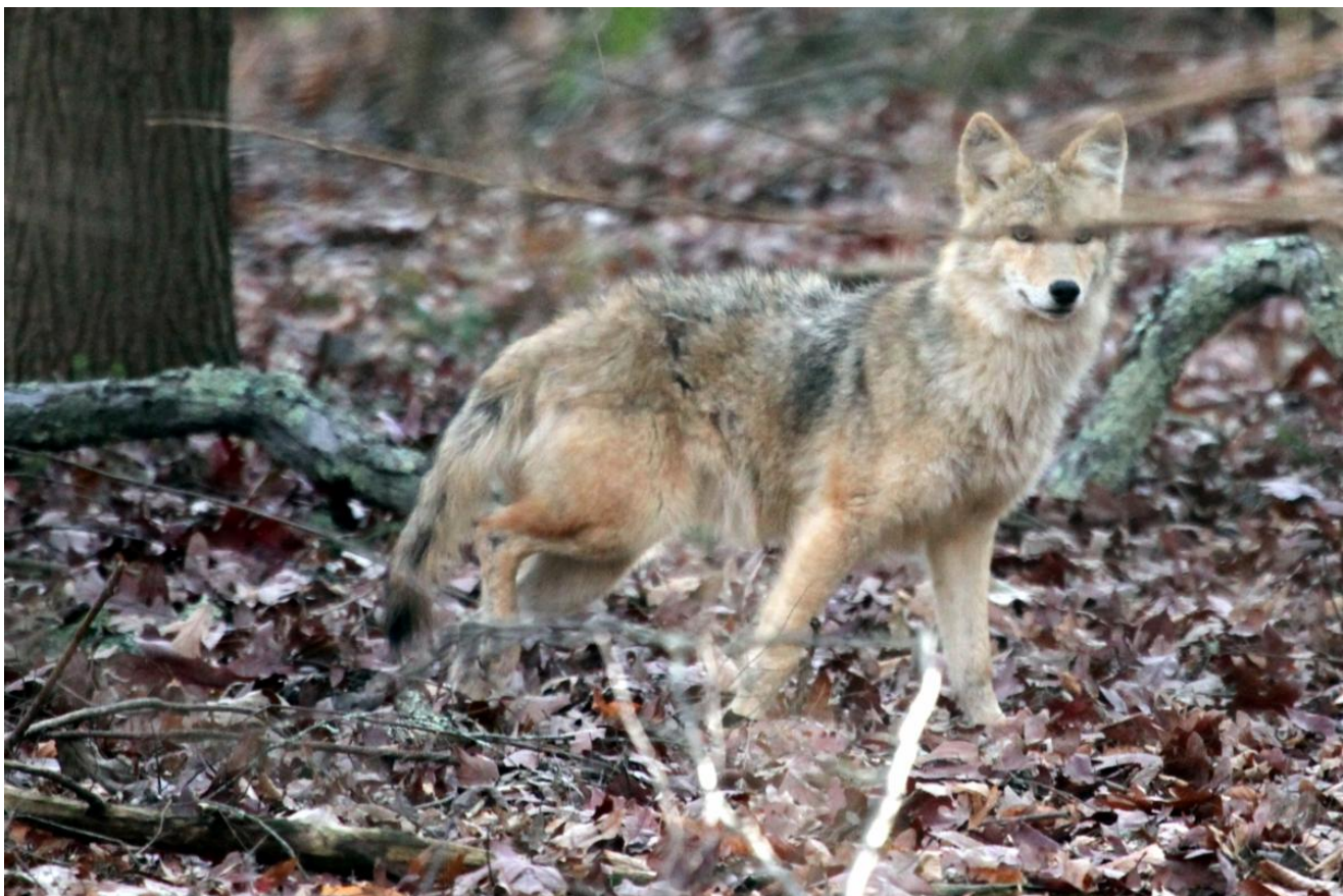
A coyote traveling near Hut Hill Road on the Bridgewater/Roxbury line. Coyotes in Connecticut can be light in color, ranging from blonde to whitish-gray, but can vary greatly.