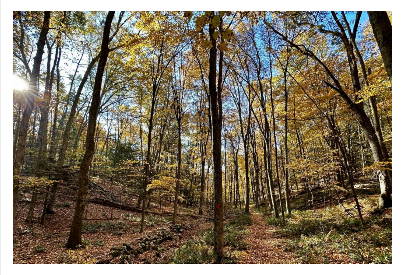
A trail along our new Tappen Brook Preserve.