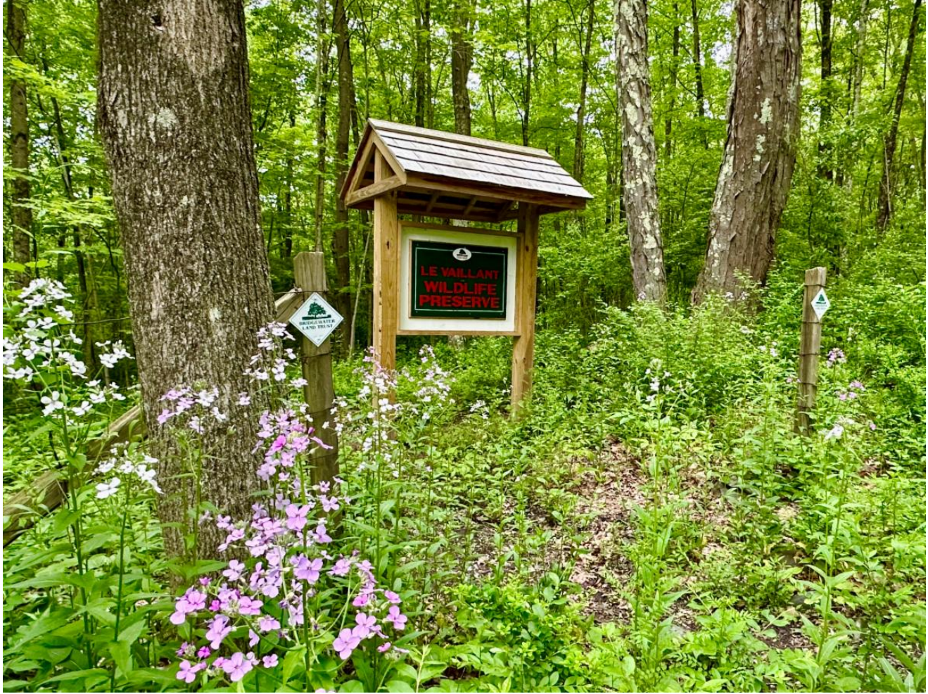
The entrance to the Le Vaillant Wildlife Preserve on Christian Street.