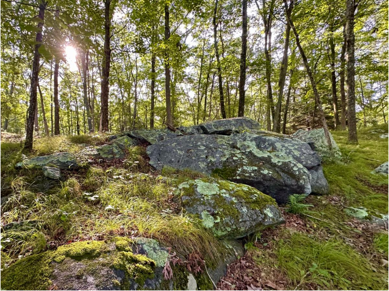
A glimpse of Tappen Brook Preserve along Hemlock Road.