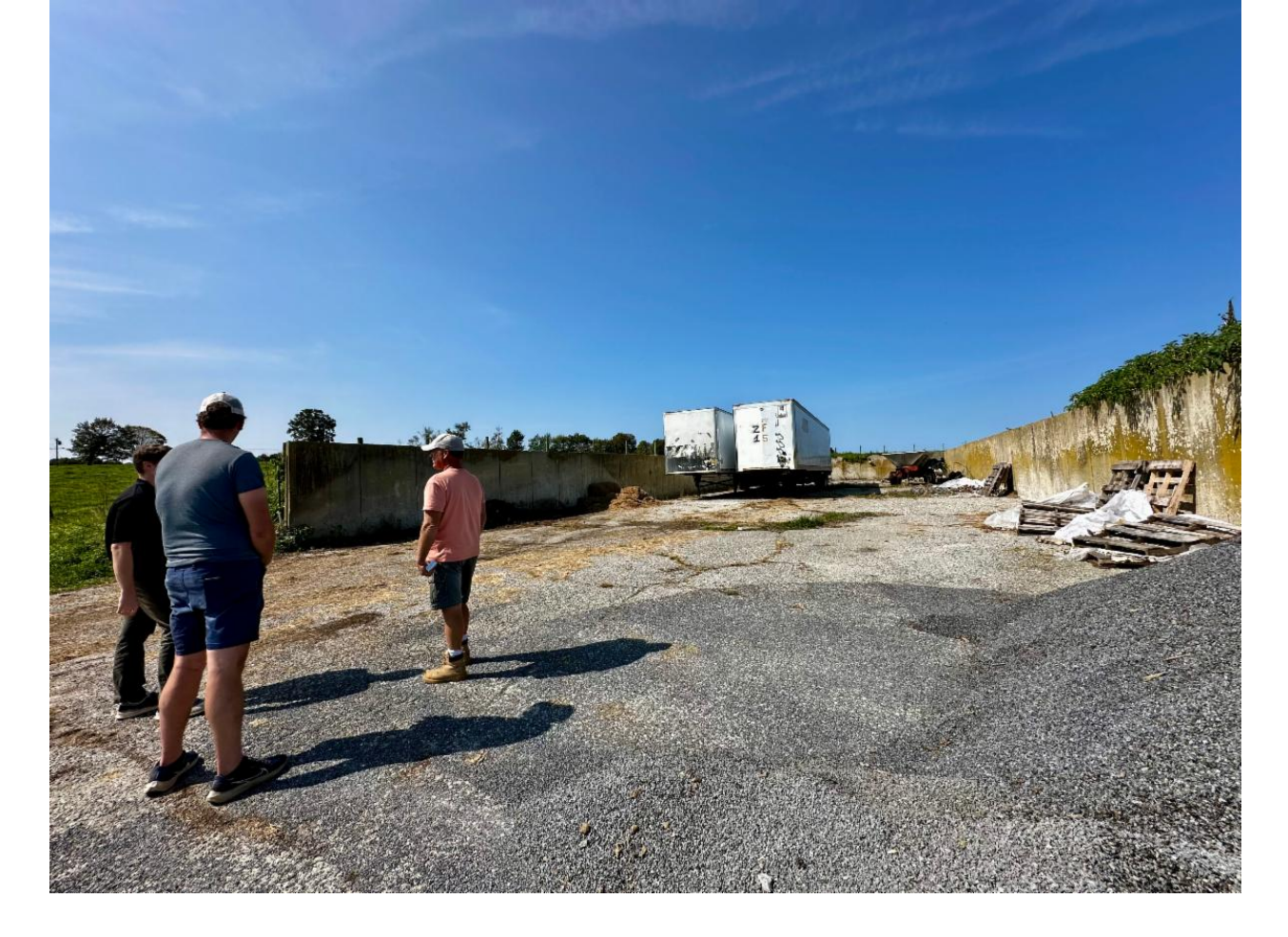
The existing "bunker" where the new hay storage building will be installed.