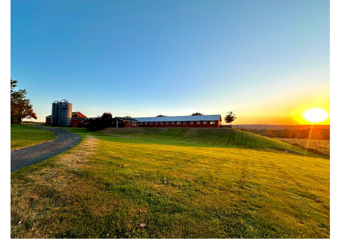
The south end (the side opposite the silos) will be upgraded in 2025.