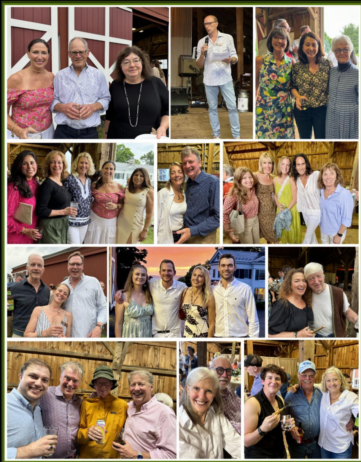
Lots of smiles at the "Party In The Barn"