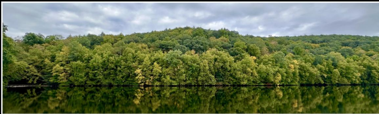
Opened new trail network: Tappen Brook Trails