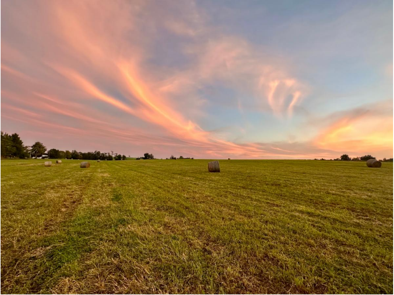
A view of our Jane Pratt Farm Preserve on Town Line Road