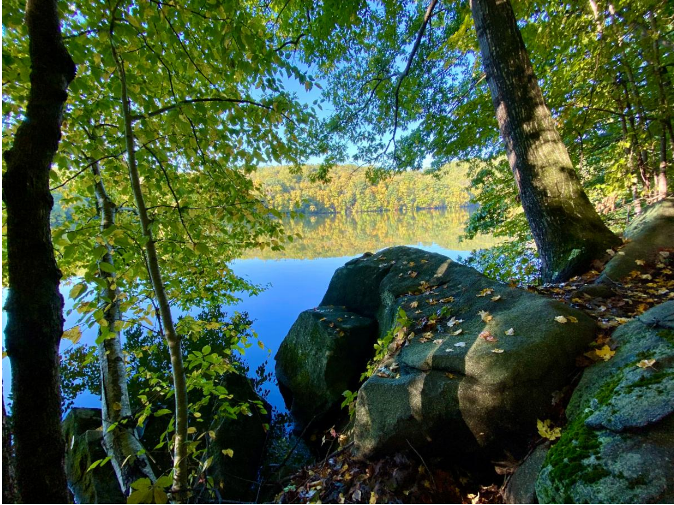
A glimpse from our trails on Lake Lillinonah near the Town Park in Bridgewater.