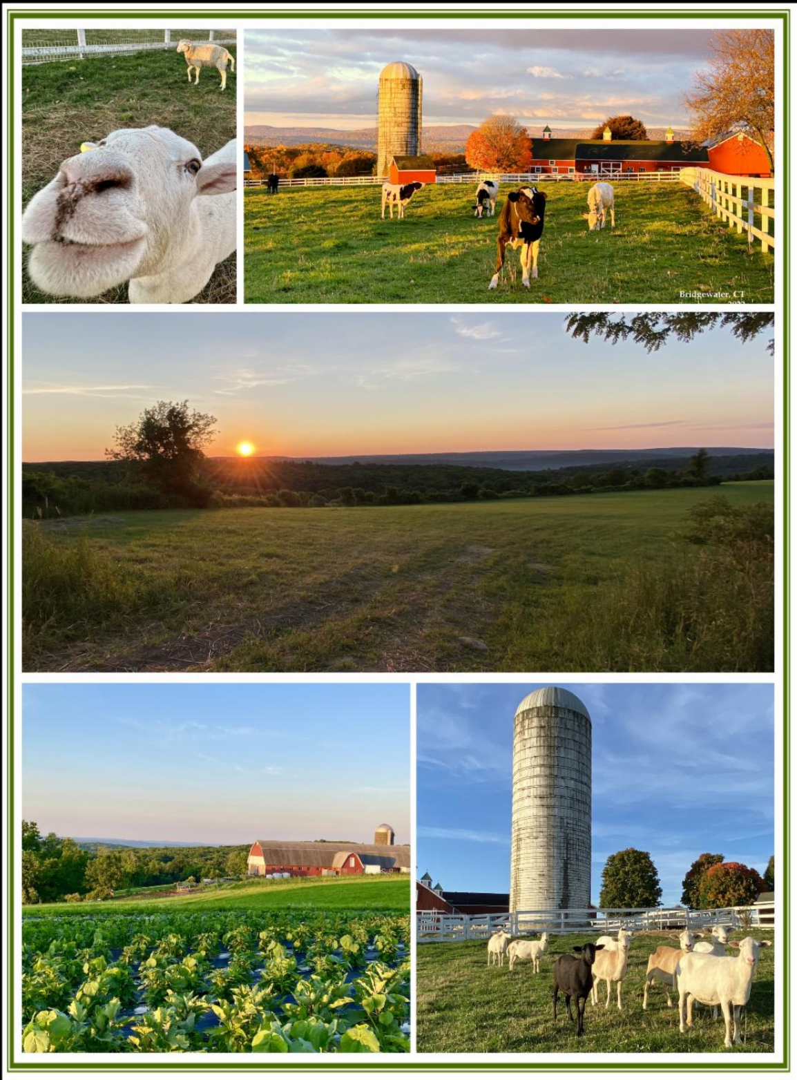
Views from the On The Ridge Benefit.