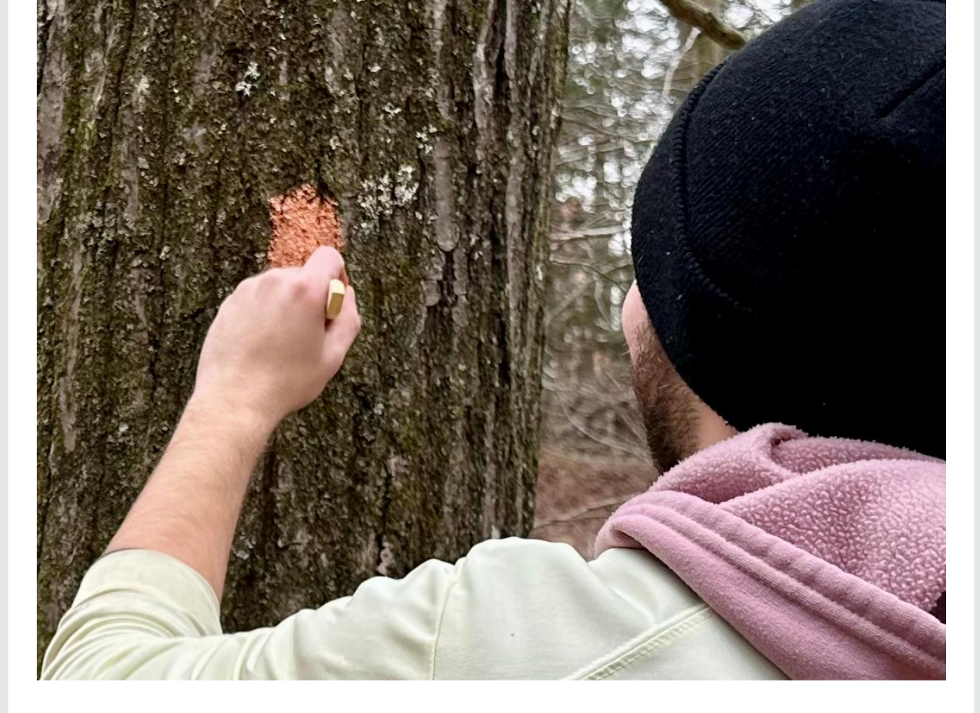
Trail blazing at Tappen Brook Trails