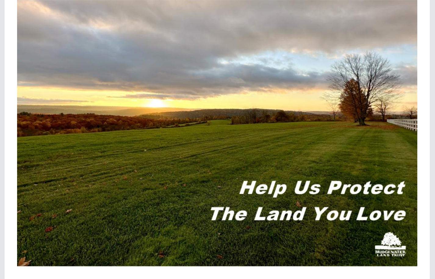
View from Second Hill Road, Bridgewater