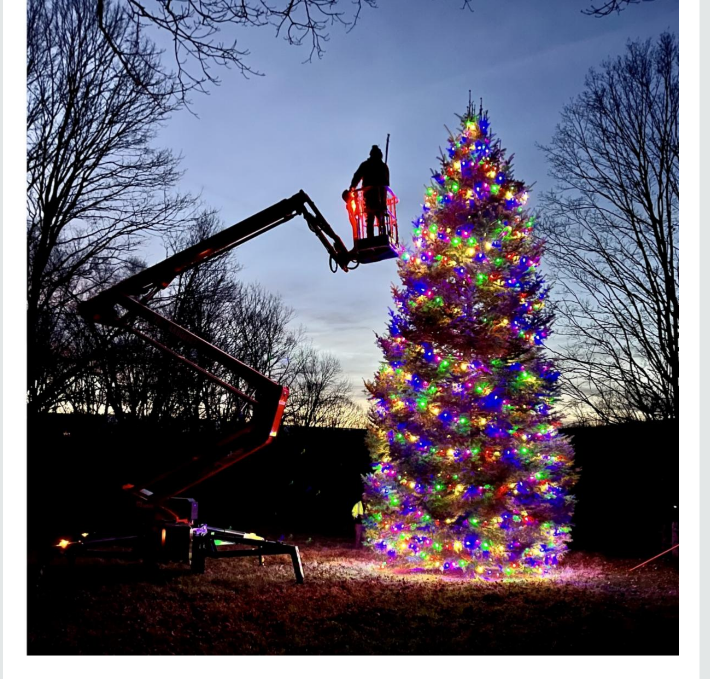
Connor Dillon finishes placing the top string of lights.